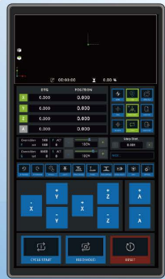
i CNC controller (15.1" touch screen)